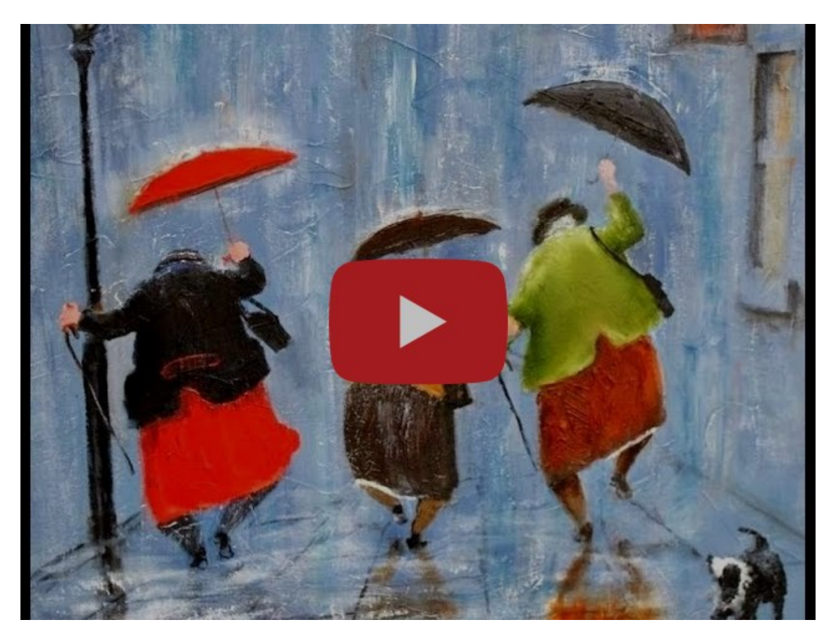
Everyone Needs a Best Friend

Everyone needs a best friend – Great illustrations accompany Nora Jones as she sings (below).