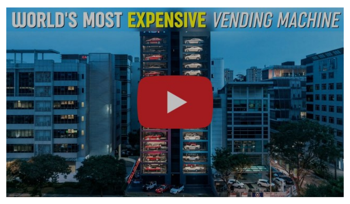
The World's Most Expensive Vending Machine

The World's Most Expensive Vending Machine - Insane of clever?