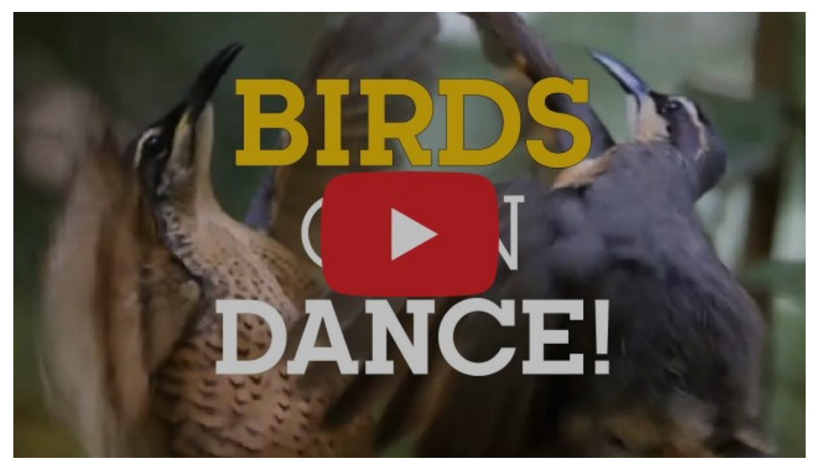
Birds Can Dance!

<u>Hot Honey Rag</u> - From the movie Chicago