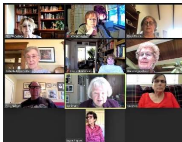
February Steering Committee meeting