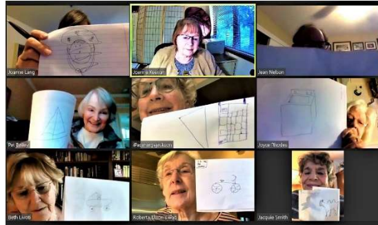
Fun playing Pictionary!

Come with your favorite beverage and play a new game. We just started playing Pictionary! We had fun playing this game in February. What you'll need: a piece or two of plain paper and a pencil or pen. You'll be on a team. One team member will get a secret word and will sketch a picture of the word in one minute. Your team will try to guess what the secret word is by looking at what you have drawn. Come and try it! No need to RSVP; the Zoom link will be sent to everyone by email.