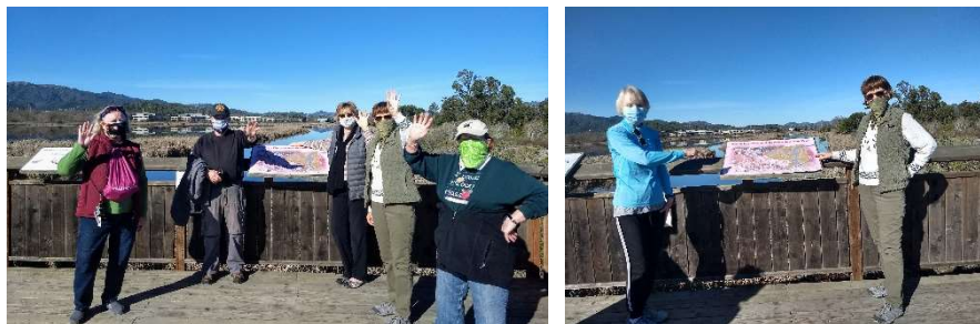
February levee walk