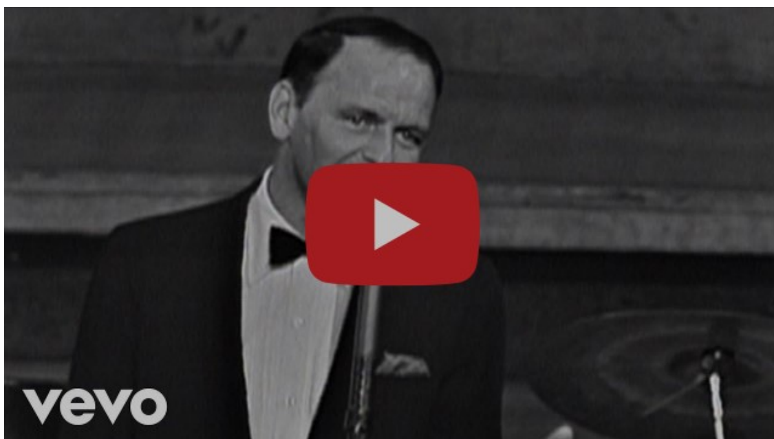
You Make Me Feel So Young