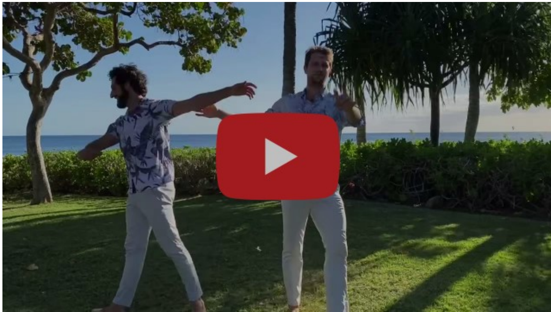
Livestream Ballet Performance from Hawaii