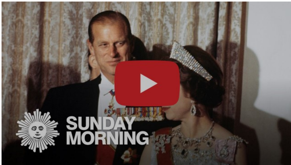
Remembering Prince Philip, Duke of Edinburgh

Remembering Prince Philip. CBS Sunday Morning Video. (below)