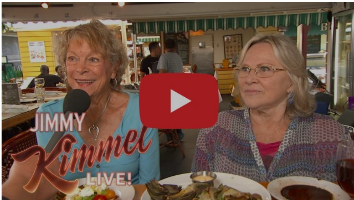
Senior Citizens Share Their Sex Secrets

Email message from Florida or? Check those email addresses!