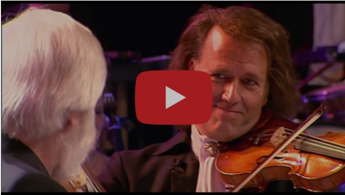
André Rieu & John Sheahan – Irish Washerwomen