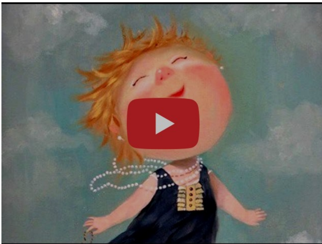
Madeleine Peyroux – Smile