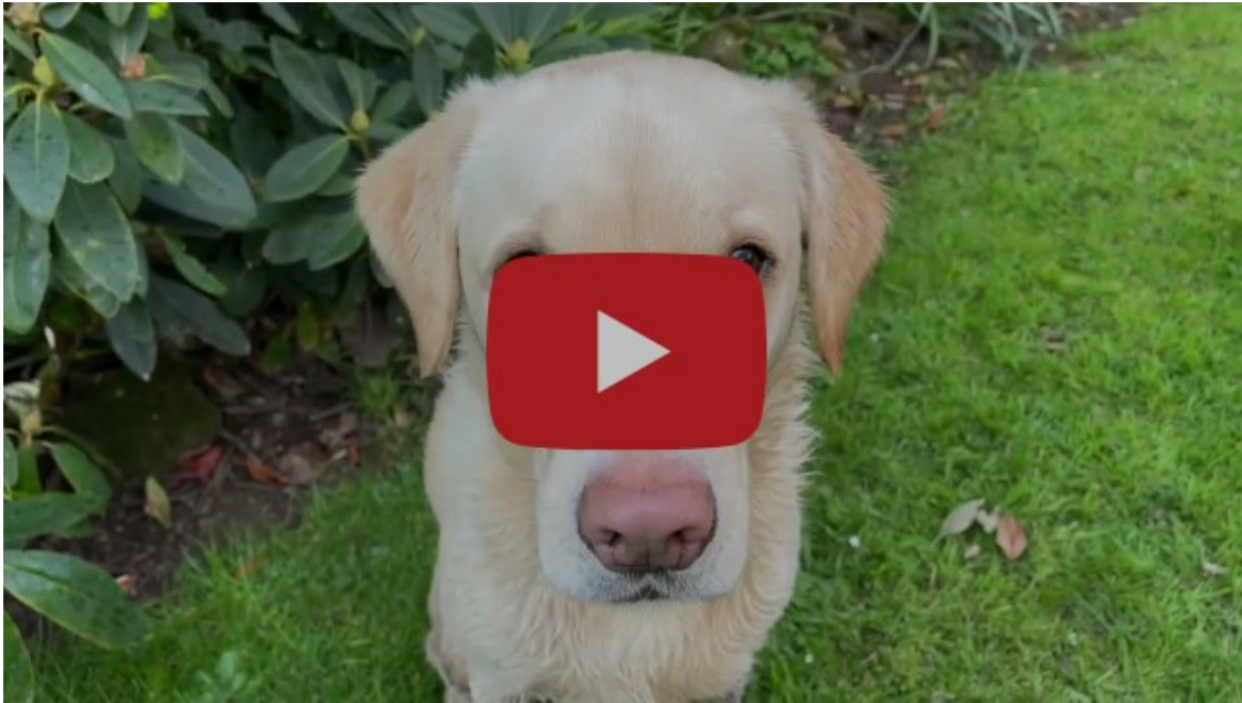
Olive and Mabel – keeping up appearances