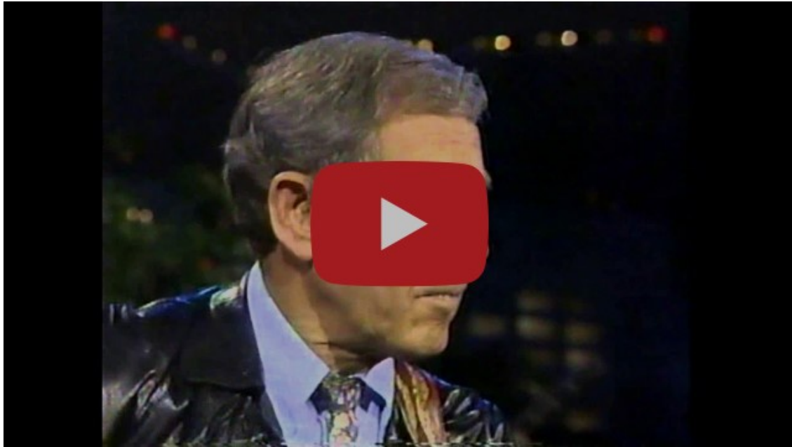
Chet Atkins "Mr Guitar" 3 of his very best

Chet Atkins—three of his best. That guy could play! (below)