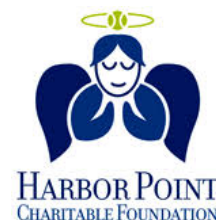
Harbor Point Charitable Foundation