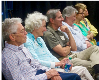
Soil vs Dirt