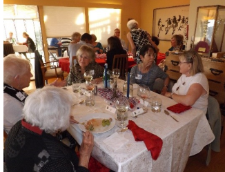
Dinner with a Legend Event