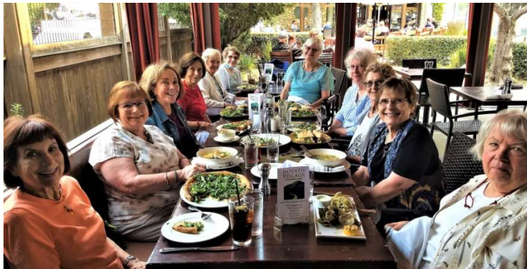
We enjoyed lunch at Boca Pizzeria in August