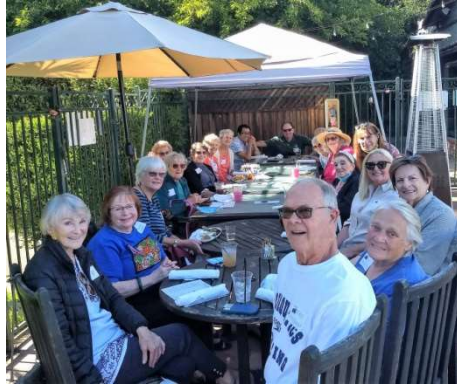
August Happy Hour at Rickey's