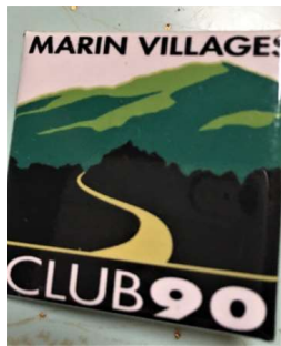
The CLUB 90 pin

Welcome to CLUB 90! We have two new members in CLUB 90—celebration time!