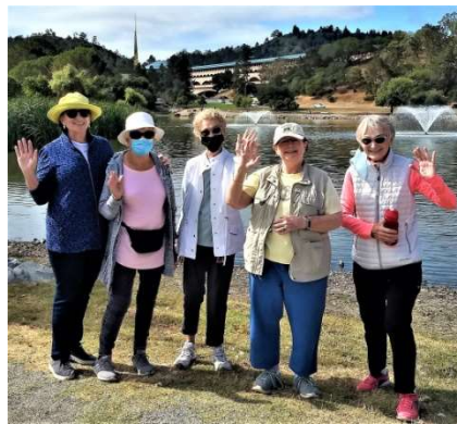
Civic Center Lagoon walkers in August