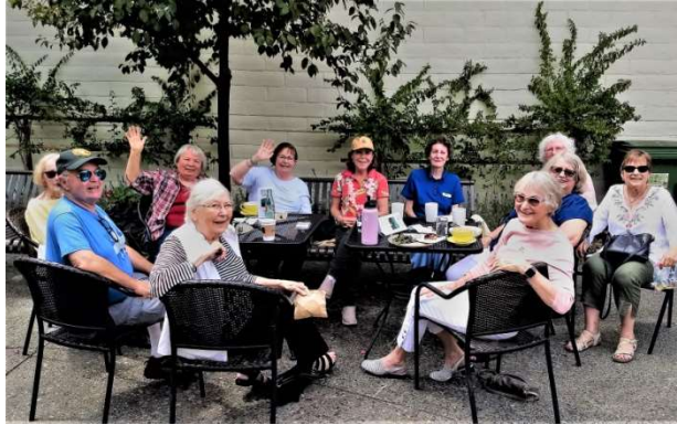
Novato Villagers at the August debut for CoffeeTea&Chat at Creekside Bakery