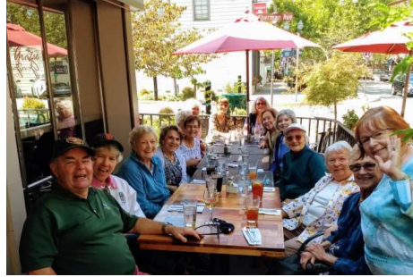
Lunch at Grazie in September—a beautiful day!