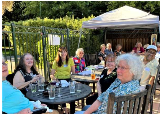
Enjoying Happy Hour at Rickey's in September—see you in October!