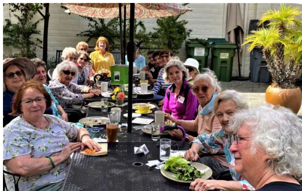
September was breezy for our CoffeeTea&Chat