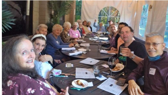
Enjoying the last Happy Hour of 2021—see you in 2022!

Happy Hour at Rickey's in October. Sorry, there will be no Happy Hour in November or December. Wait for the new year!