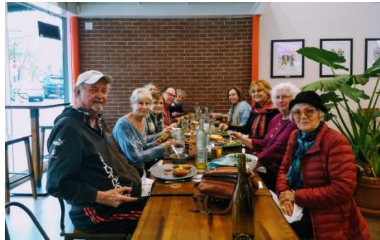
Enjoying JD's BBQ indoors—October's stormy weather