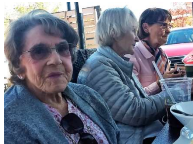
CoffeeTea&Chat at Panera on October 13—beautiful!