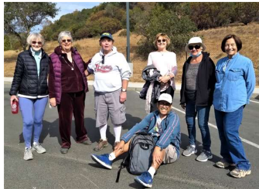
October's autumn walk at Indian Valley College