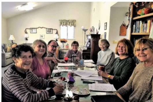
Novato Village Steering Committee at the October meeting