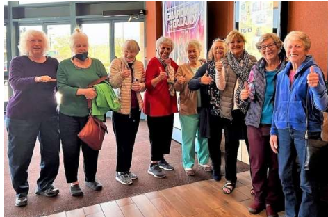
The movie crowd viewed Air in April