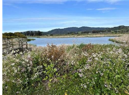
Beautiful vistas at Las Gallinas Valley Sanitary District Ponds in April