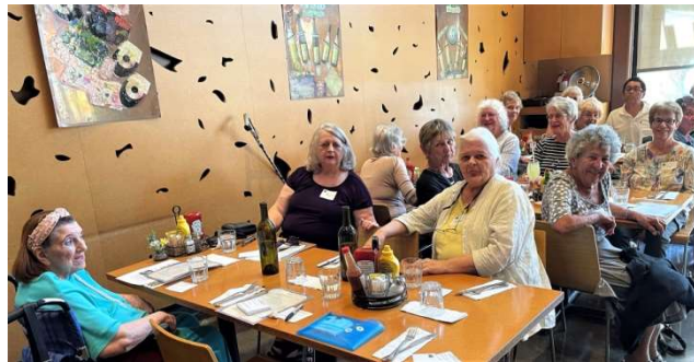
April Happy Hour at Toast

Las Guitarras provides a warm and friendly ambiance. It is family-owned and operated for 42 years, with a full bar and outdoor patio, and voted Best Margarita by Novato Patch readers. The popular restaurant is a Marin favorite that provides a family dining atmosphere and is known for its savory variety of traditional and authentic homestyle meals while creating an inviting ambiance in beautiful Old Town Novato.