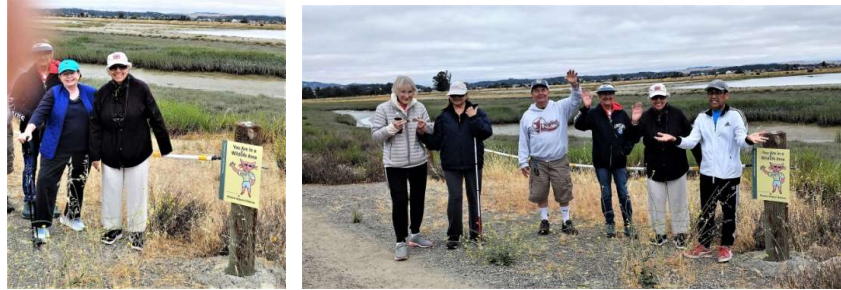
Seven Hamilton Levee walkers in July