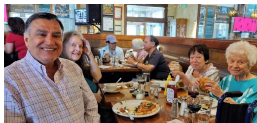
Moylan's lunch was a treat in July!