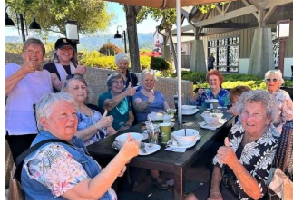
Village Viewers give “thumbs up” to the July movie