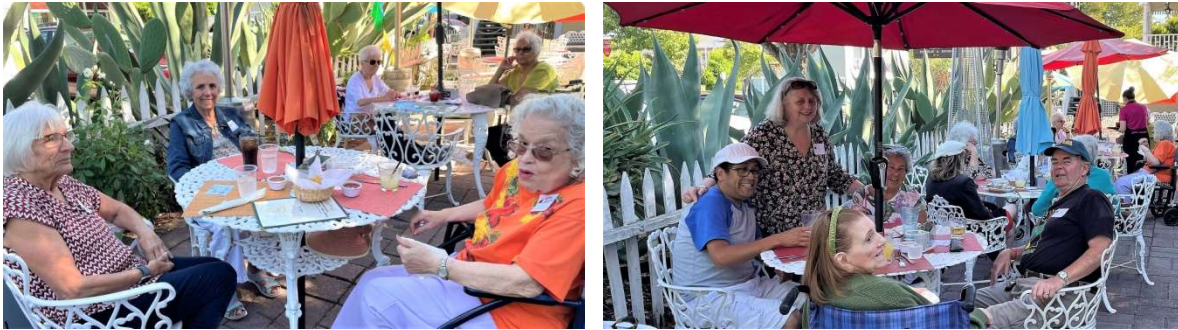
Novato Villagers enjoy Las Guitarras at the July Happy Hour