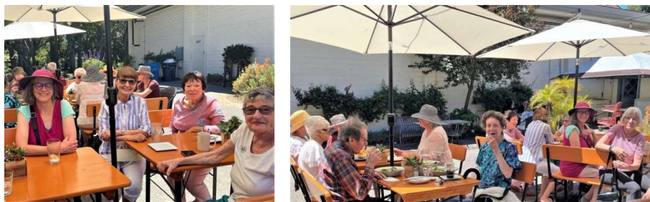
July: Novato Villagers enjoy Creekside Bakery's ambiance