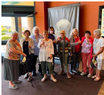
The Village Viewers Movie Group says thumbs up!

In August, the movie was Oppenheimer , starring Cillian Murphy and Emily Blunt. The story was about Robert Oppenheimer and a team of scientists appointed to work on developing the atomic bomb. The movie was touching and led to a good discussion.