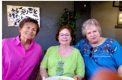
August lunch at The Village—Italian Restaurant & Pizzeria was a treat!