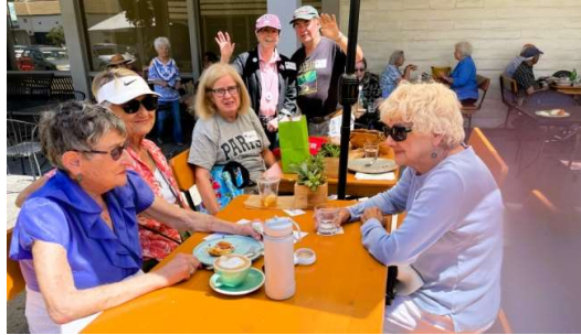
CoffeeTea&Chat at Creekside Bakery—August gathering