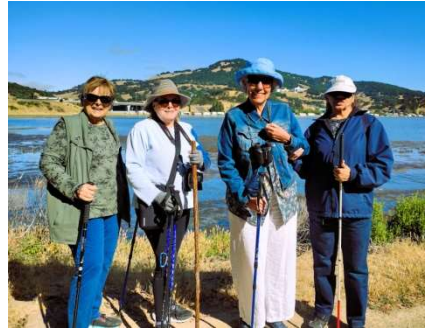
August walk—Rush Creek Preserve is always delightful!