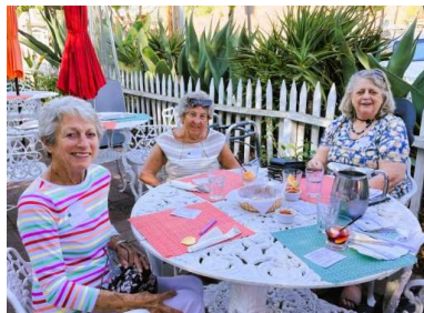
August Happy Hour at Las Guitarras—see you at a new place in September