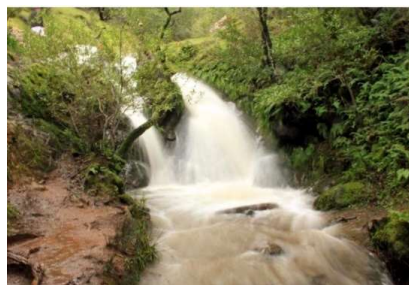
Ken Harth Waterfall Trail