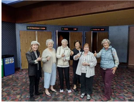
Thumbs up for Golda!