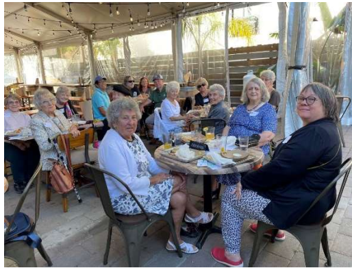
September's Happy Hour!

https://blazersnovato.com/ Menu choices: https://blazersnovato.com/menu