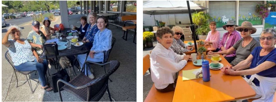
September at Creekside Bakery enjoying CoffeeTea&Chat