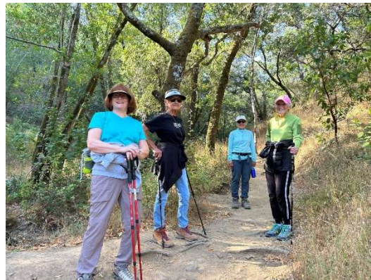
Hike at the Ken Harth Waterfall Trail in September