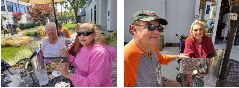
Beautiful day on the patio at kitchen in September