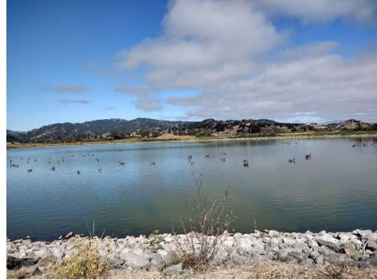
Beautiful weather, geese, yellow yarrow on the trail at the Las Gallinas Pond in September