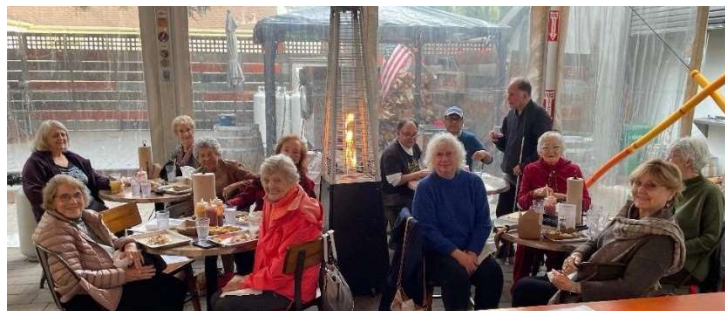
The November Happy Hour at Blazer's was warm and cozy