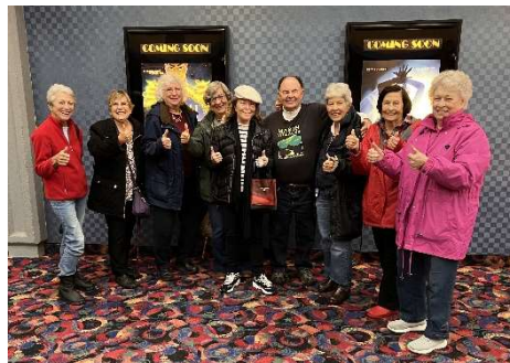
Lots of "Thumbs up!" votes for November's movie!