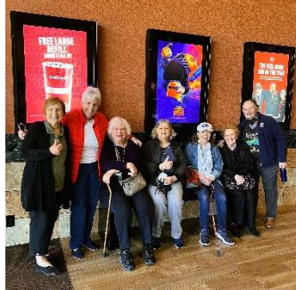
A dedicated group of movie viewers in March!