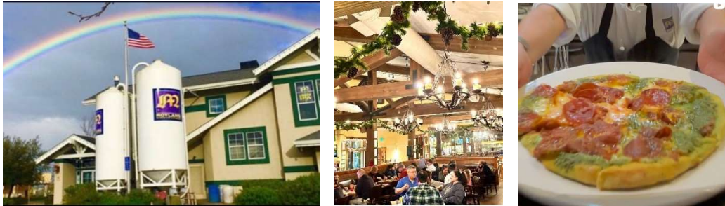
We enjoyed our lunch at Moylan's on March 20 th