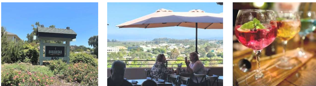
Happy Hour was at Ayawaska Hilltop in March. See you there in April!