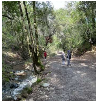
A view from the March Walk at Indian Valley College campus

Turn right on Hanger Ave. (off Hamilton), go at least 2 – 4 blocks, and the parking lot is on the right side of Hanger Ave. This is a firm, denatured granite path. Please RSVP to Pat Bailey at pbailey49@aol.com or text or phone (415) 652-9073.