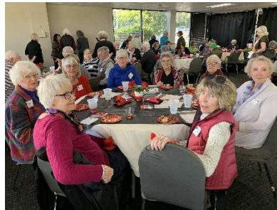
Food, drink, and many friends