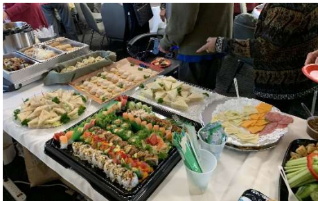
A beautiful spread

This event was the first of three Aging in Marin speaker events. The next will be in May and will focus on financial concerns and fraud. Another will be held in the fall on nutrition and health. Keep an eye out for these.